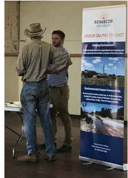
Figure 2. Renascor personnel at community information sessions held in Arno Bay and Cleve