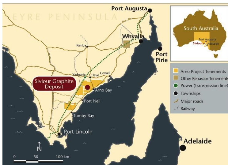
Figure 1. Siviour Graphite Project