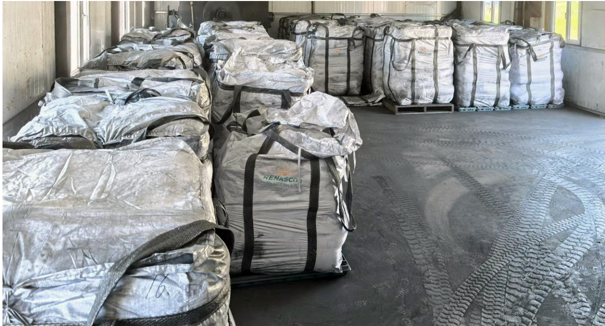
Figure 1. Siviour graphite concentrate feedstock from recent bulk sample production

Renascor Resources Limited (ASX: RNU) ( Renascor ) is pleased to announce the successful production of graphite concentrate from an approximately 730 tonne bulk sample from the Siviour Graphite Deposit to support Renascor's Australian Government co-funded 10 Purified Spherical Graphite ( PSG ) demonstration facility.